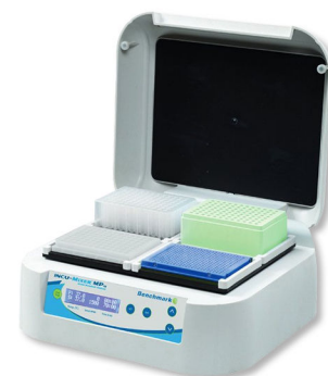
Incu-mixer™ MP Heated Microplate Vortexer, 4 position Mixer

Speed Range: 200 to 13,500 rpm (up to 16,800xg) Capacity: 24 x 1.5/2.0ml 2 x PCR Strips (16 x 0.2ml)