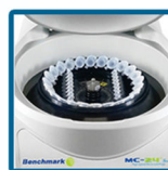
Unique Combi-Rotor Accepts tubes and strips