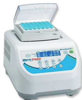
MultiTherm™ Thermal Shaker

Temp. Range: Ambient +5 to 70°C Shaking Orbit: 2mm Shaking Speed: 100-1,500 rpm