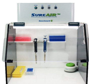
SureAir™ PCR Workstation