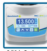
Full Color Touchscreen