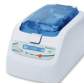
BeadBug™ 6 Six Position Homogenizer

Light Source: 8W UV-C Bulb Int. Dimensions: 19.7 x 15.4 x 15.7 in.