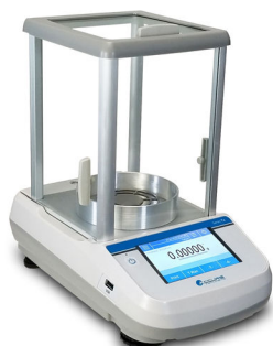
Accuris™ TX Balance, 220g

Kickstart the Semester with Lab Favorites for $2,025